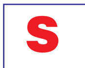
S Boat Class Flag