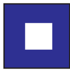
Preparatory Flag (Code Flag P)

All classes will have a separate 5-minute starting sequence as follows: